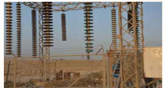
Fig. 2. KFUPM Sensor node based WSN for monitoring natural pollution deposition levels on HV insulators in outdoor insulator yard.